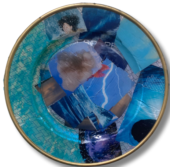
Art decoupage plate by KFTC Youth Organizing Fellow Journey Hicks, 2023.

Look at what we can create! Day three of the YOF included an art workshop session with locally renowned artist Julia Youngblood at the Kentucky Center for African American Heritage. YOF fellows created decoupage plates to represent their unique identities, and grouped together for larger, composite pieces. Their art is now published in the 2023 YOF Art Book (housed at JCKFTC in Smoketown).