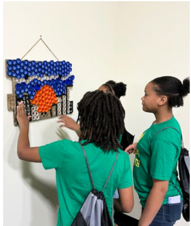
2023 Youth Organizing Fellows in their exhibit at the West End Louisville Math & Science Human Anatomy Day at KCAAH, July 15, 2023.

Locally sourced from JCKFTC’s partnership with Noe Middle School art students, the program is a continuation of the collaborative process between traditional and community learning: empowering students to expand their interests outside of the classroom, into new environments.