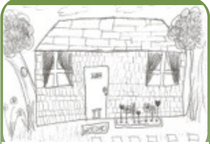
This drawing is by a student at Warren Elementary and is on the cover of the Barren River Area Renters' Handbook.

These community and advocacy organizations support URLTA as an important and necessary solution for access to safe and healthy housing in Kentucky: